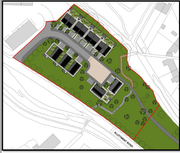
Figure 1 – Proposed Site Layout