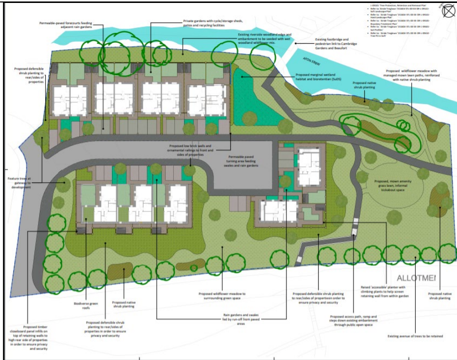
Figure 3 – landscaping arrangement